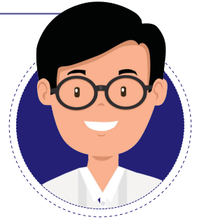
ILLUSTRATION OF PRACTICE NO. 1: